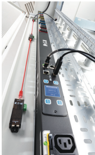
Eaton EMP Gen 2 daisy chained on rack PDU