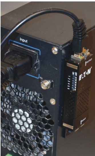
Eaton EMP Gen 2 installed on UPS

1. Due to continuing improvements, specifications are subject to change without notice.