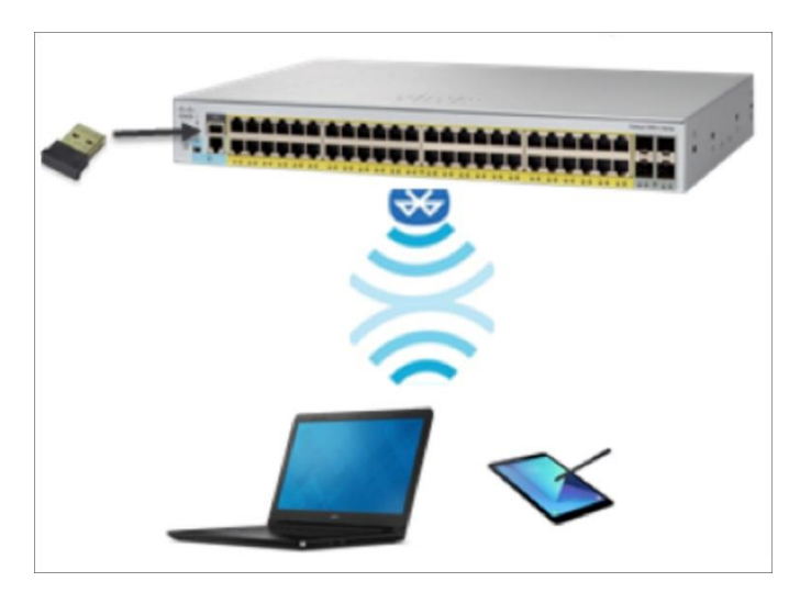
Figure 2. Over-the-air switch access using Bluetooth