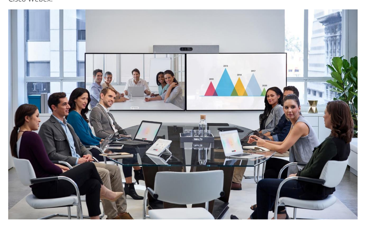
Figure 1. Cisco Webex Room Kit Plus in Large Conference Room

The Room Kit Plus – comprising a powerful codec and a quad-camera bar with integrated speakers and microphones* – is ideal for rooms that seat up to 14 people. It offers sophisticated camera technologies that bring speaker-tracking and auto-framing capabilities to medium to large-sized rooms. The product is rich in functionality and experience but is priced and designed to be easily scalable to all of your conference rooms and spaces – whether registered on the premises or to Cisco Webex.