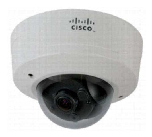
Figure 1. Cisco Video Surveillance 3520 IP Camera

The Cisco Video Surveillance 3520 IP Camera offers a variety of benefits, including: