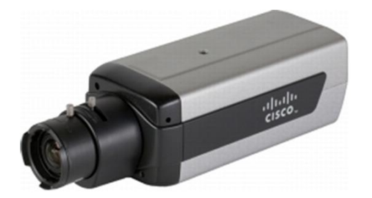
Figure 1. Cisco Video Surveillance 6000P IP Camera

The Cisco Video Surveillance 6000P IP Camera offers a variety of benefits, including: