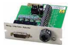
Relay Interface cards