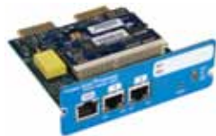
Power Xpert Gateway Card 2000