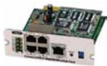
ConnectUPS-X Web/ SNMP X-Slot card