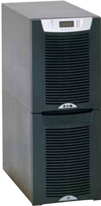
9155 8-15 kVA

Reliability and efficiency have never looked so attractive. The 9155 single-phase Uninterruptible Power System (UPS) delivers a combination of advanced technology, user-friendly design and low price that's absolutely unmatched by competing products. This innovative design offers high efficiency (90 percent or better across all load ranges), low input current distortion (less than 5 percent total harmonic distortion, with an active IGBT rectifier that delivers 0.99 power factor correction) and high power factor output (0.9 PF).